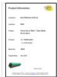
Front Cover From an O & M Manual