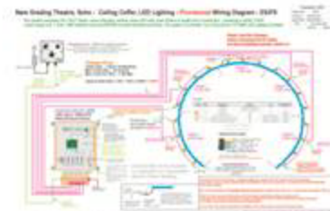
Typical Wiring Diagram